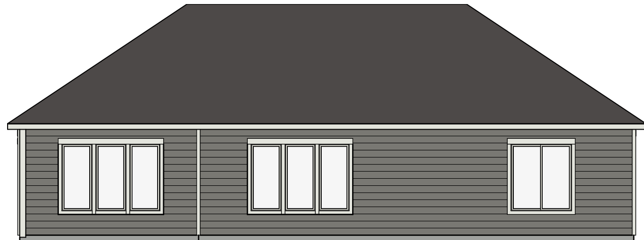
2 A-1 SOUTH ELEVATION 1/8" = 1'