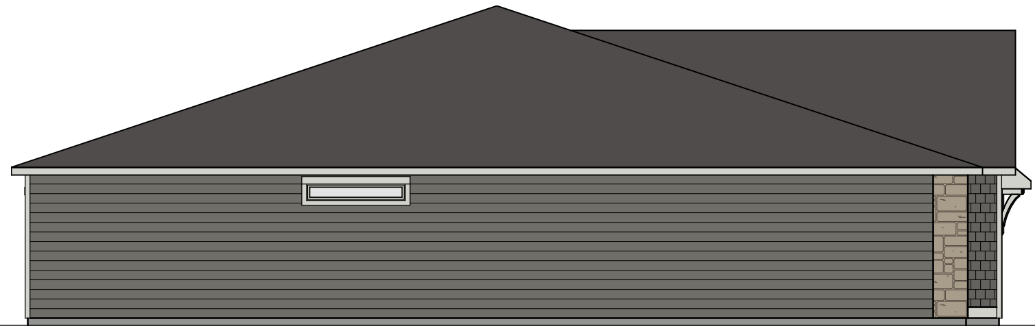
3 A-1 EAST ELEVATION 1/8" = 1'