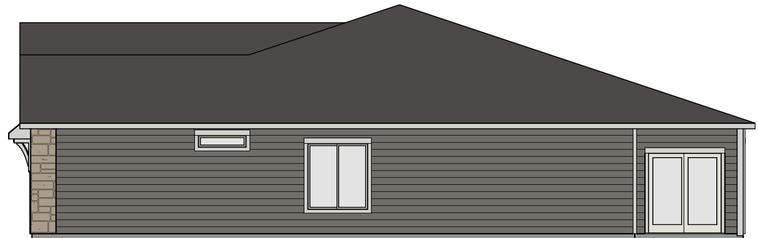
4 A-1 WEST ELEVATION 1/8" = 1'