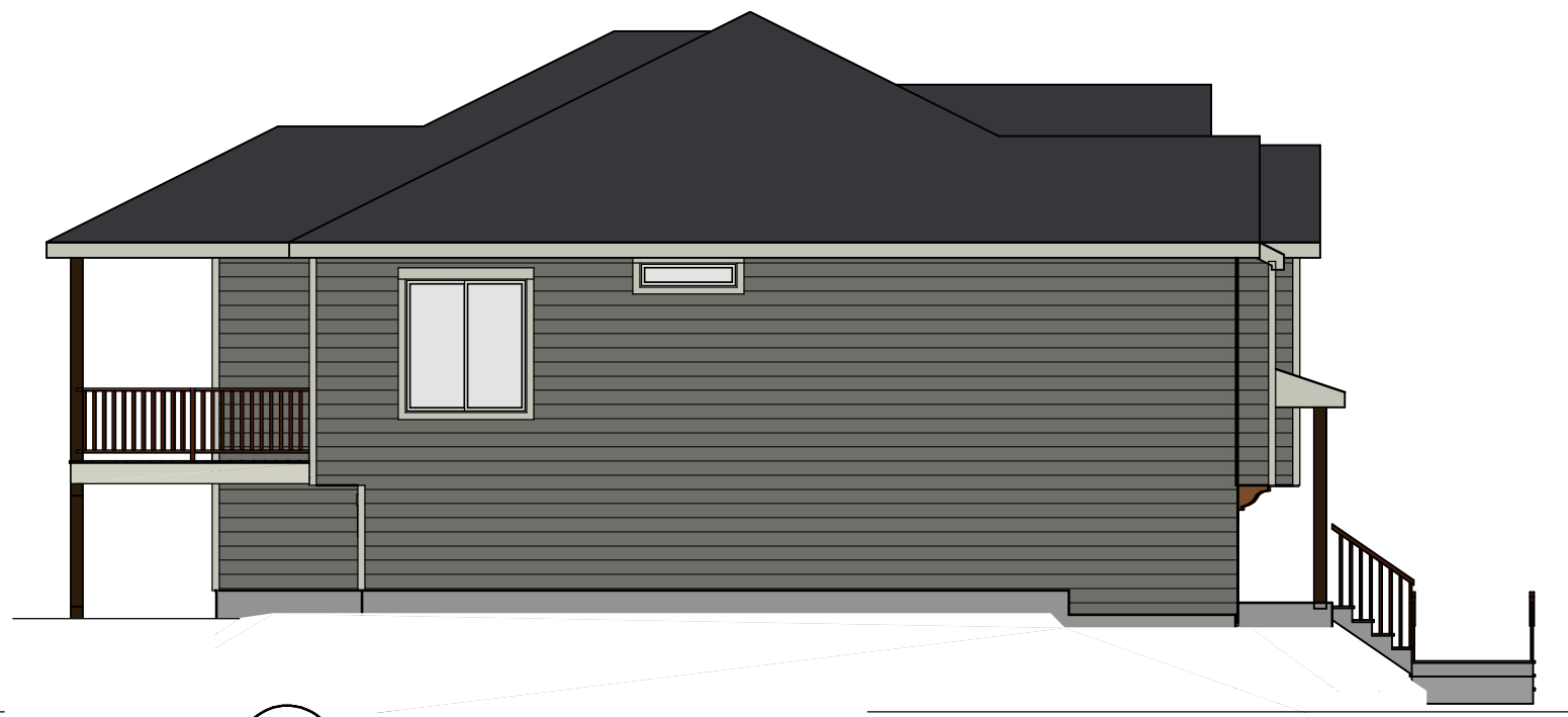
3 EAST ELEVATION A-1 1/8" = 1'