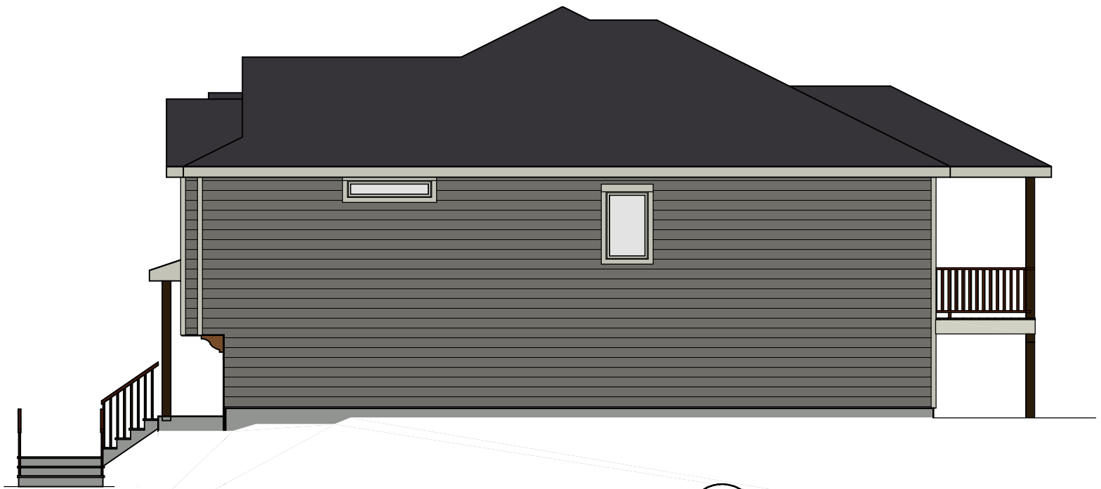
4 WEST ELEVATION A-1 1/8" = 1'