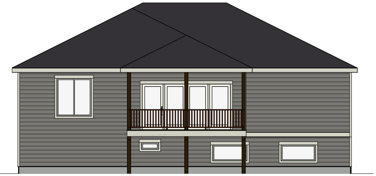
2 SOUTH ELEVATION A-1 1/8" = 1'