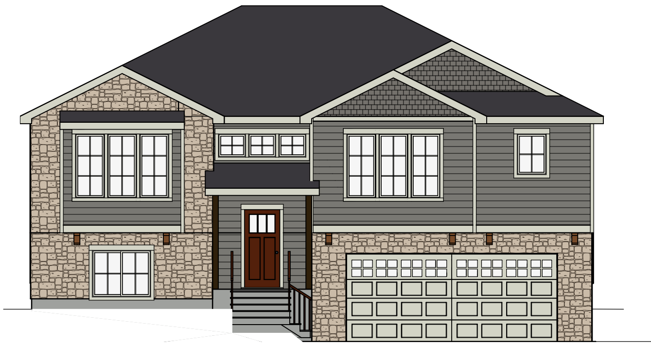
1 NORTH ELEVATION A-1 1/8" = 1'